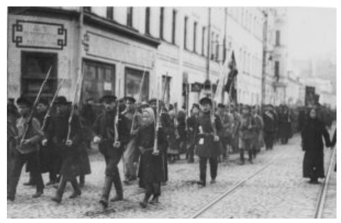
Russian Revolution: Bolsheviks in Moscow.

The third division separates the "revolutionary" currents, for which the break with capitalism necessarily involves revolution, from the "reformist" currents, which aspire to transform social and political institutions by peacefully gaining power. This division was shaped in the 19th century and took on considerable importance with the Russian Revolution of 1917 and the creation of the Communist International (Third International) in 1919. The Third International's membership provoked a definitive split between revolutionary and reformist currents within the labour movement.