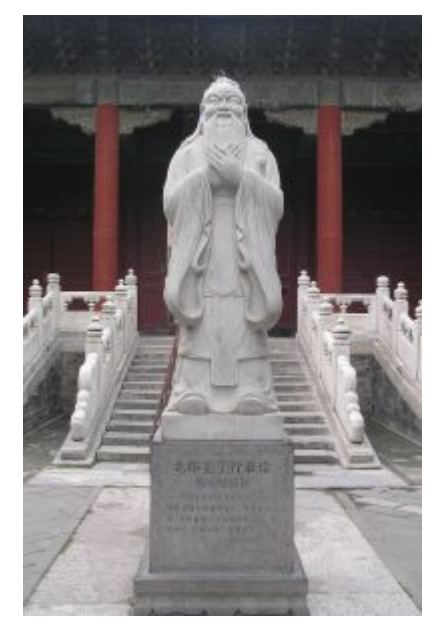
Confucius is often considered one of the most important and influential philosophers. His teachings and philosophy formed the basis of East Asian culture and society, and remain influential to this day.

As the term Confucianism indicates, this ideology originated with Confucius, an ancient Chinese scholar. The resurgence of Confucianism in China and the rest of Asia is a phenomenon worthy of discussion and reflection. Confucianism was the primary cultural tradition of the Chinese civilization for more than 2,000 years.