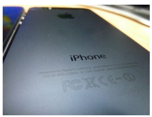
The iPhone, the iconic symbol of the information age, is designed in California, but made in China from parts that are globally supplied, and reliant on rare-earth materials from Africa and China. Apple's profits, however, are booked in Ireland in order to avoid paying most, if not all, taxes.

What this says is that compared to 1945, or even 1991, the balance of power – of influence – in the international system has become more complex and has shifted to a global spread rather than being North-Atlantic based. And while the US faces no global military threat, it faces rising regional powers, many of which are locked with it in economic interdependence. Most notably is China, which has shown the potential to become a challenger to America's global position.