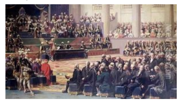
The opening of the Estates General in Versailles in 1789.

When people think about the similarities and differences between particular ideologies, they are often drawn to a spatial metaphor: the left-right "spectrum" or "continuum." This left-right spectrum – an imaginary line, in effect – is an organizing device that helps us sort out how different ideologies relate to each other. A person is "on the left" of this line if their views reflect those of left-wing ideologies, and they are "on the right" if their views reflect those of right-wing ideologies. But what do these labels mean?