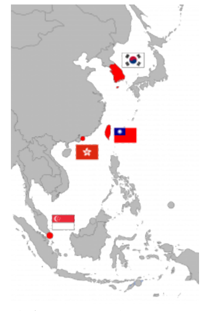
The four Asian Tigers/Dragons are seen here with their respective flags. The four Asian Tigers are (from North to South): South Korea, Taiwan, Hong Kong and Singapore. In the second half of the 20th century, they underwent rapid industrialization and maintained exceptionally high growth rates and have developed into high-income economies.

Thus, we need to understand some of the ideals, virtues, and concepts of Confucianism in relation to the economic and political development of these Asian entities. Many observers have attributed the success of Confucian countries (China, South Korea, Japan, Singapore, Taiwan, Hong Kong) to their common cultural values, such as respect for authority, loyalty to good leaders, a preference for order, hard work, careful spending and an emphasis on education. These attributes are all cornerstones of the ideology.