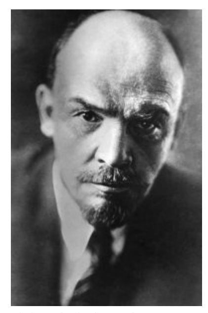
Vladimir Ilyich Ulyanov (known as Lenin)

Communism was clearly different from socialism under the influence of Vladimir Ilyich Ulyanov (known as Lenin). Lenin develops the concept of the dictatorship of the proletariat theorized by Karl Marx in order to propose a proletarian state that would help establish a communist society. Lenin suggests that this state can be called communist "as the means of production becomes common property, the word 'communism' is also applicable here" (Lenin, [1917] 1999), adding that it is certainly not integral communism. Thus, in Lenin's vision, a political regime can be qualified as "communist", though only imperfectly so.