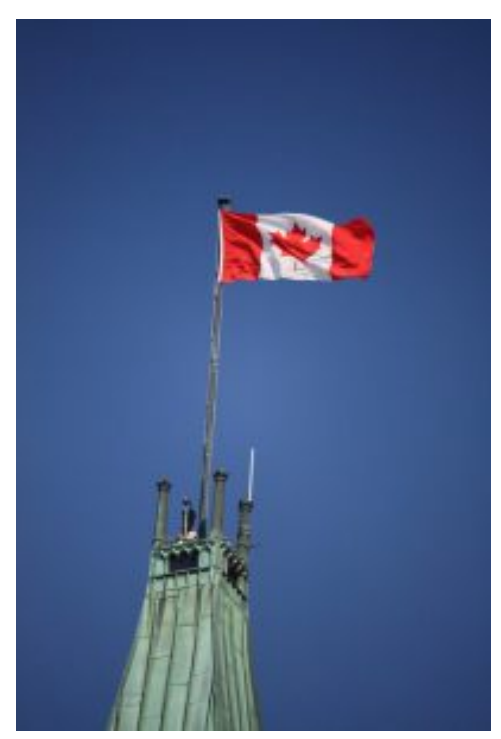
As Billig mentions, the flag (or any other symbols) often go unnoticed in front of buildings.

The most common symbol Billig employs to illustrate this specific type of nationalism is the flag. There are, according to him, two ways in which it is used. First, there is an active use of the flag: the waved flag. This expression refers to the most conscious use of the flag-or any other national symbols, signs, references, or lexicons-to assert a sense of national belonging or to make a statement involving the nation on occasions such as national holidays or international sports competitions. Second, there is a passive use of the flag: the unwaved flag. This term applies to a flag-or again any other national symbols, signs, references, or lexicons-that goes unnoticed, on a public building for example, but that reminds us unconsciously of our national belonging. Billig argues that everyday life is filled with waved and unwaved flags: the lexicon of politicians (us the nation, them another nation); the weather forecast, which geographically reminds us of where we are in our nation, but also in a world divided into nations; international sports competitions; or again wars between nations that fight for the liberty and freedom of the people of a nation.