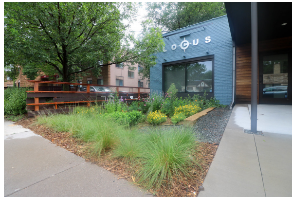
Figure 9.4 Example of a rain garden

Rain gardens are shallow infiltration basins located in depressions and low lying areas that capture and temporarily retain water for infiltration and groundwater recharge. Porous soil filters pollutants and allows for uptake and transpiration by plants to reduce air and water temperatures. Figure 9.4 shows an example of a rain garden. Note that the roof downspout enters the rain garden, and when combined with porous pavement, the site becomes an absorbent landscape.