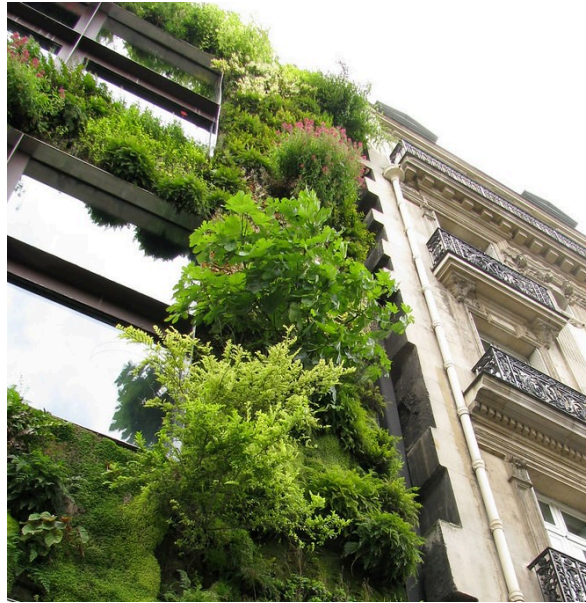
Figure 9.2 Example of a living green wall

shows an example of a living green wall on a building. Read more about the properties and benefits of green walls at this link to Green Roofs for Healthy Cities, About Green Walls [New Tab] 4 .