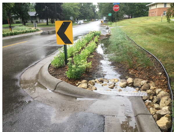
Figure 9.3 Example of a vegetated bioswale

Green infrastructure uses the process of bioretention to manage stormwater quantity and quality. Bioretention structures such as bioswales and rain gardens are designed to capture, detain, convey, infiltrate, and evaporate water from a planting. Vegetated bioswales are broad shallow straight or meandering channels with porous soil and gently sloped sides and bottom that collect and convey stormwater from one location to another while maximizing soil infiltration and plant uptake. Bioswales are designed to manage short intense periods of rain and flooding followed by dry periods. They reduce the impact of stormwater events and capture the first flush of pollutants from paved and sealed surfaces for remediation by plants and soil microorganisms. Figure 9.3 shows an example of how a vegetated bioswale captures and conveys stormwater runoff from the sealed pavement as well as the turf area.