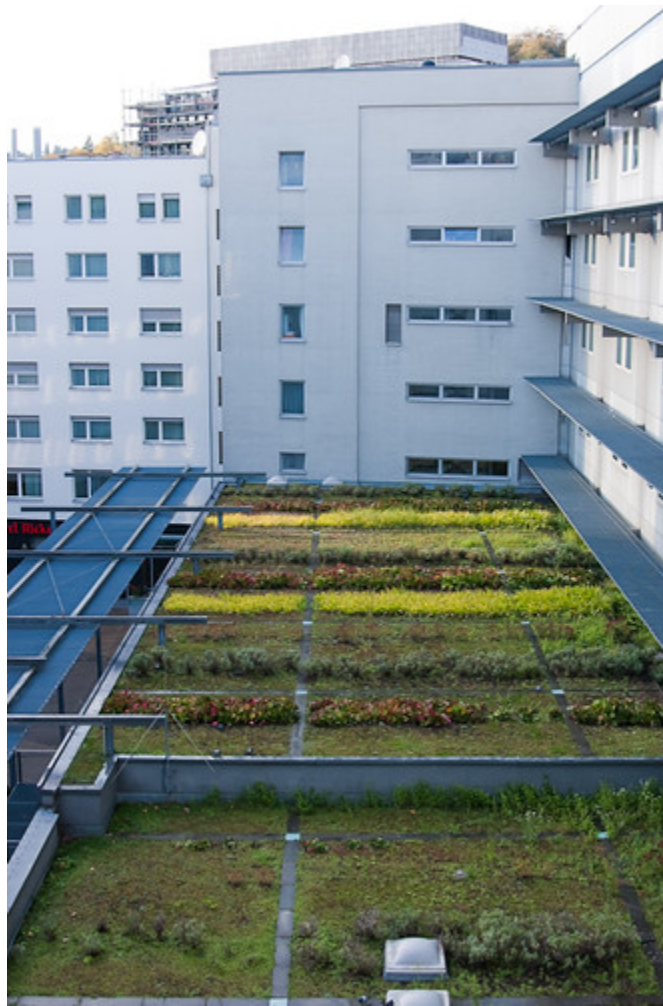
Figure 9.1 Example of an extensive green roof

Almost any plant type can be grown on a green roof however, the shallow depth and low organic content of extensive green roof growing media will be the limiting factor for plant selection. In general, suitable species are determined by examining the microclimate of the green roof and comparing it to a species' native habitat. Extensive green roof features that influence plant selection will include water availability, wind speeds, soil depths and temperatures, as well as solar exposure and climate. Plant growth characteristics for extensive green roofs include fast establishment, long lived with dense coverage, pest and disease resistance, shallow rooting, self-regeneration from seed and vegetative parts, tolerance for extreme weather and very dry to saturated conditions, and low requirements for maintenance and inputs. Examples of native habitats that match the extreme conditions found on extensive green roofs include: