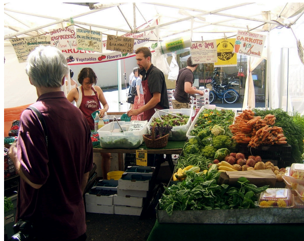
Figure 10.1 Example of urban agriculture products for sale at a farmers market stall

Communities plan and manage urban agriculture through policies, zoning bylaws, and land use regulations that allow certain public green spaces to be used for growing food. For example, community gardens for non-commercial food production that are allowed in some or all land use designations will have guidelines for safety, accessibility, maintenance, and aesthetics. Read about an example of jurisdictional policy and regulations for community gardens available at this link to City of Victoria Community Gardens Policy [PDF][New Tab]. 2