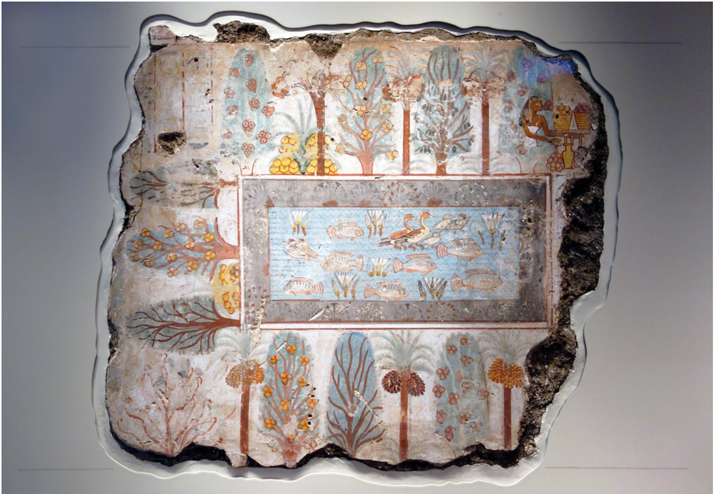
Figure 1.1 Tomb painting of an ancient Egyptian garden

From the 15 th to the late 19 th century, European world explorers collected many plants for ornamental interest and enjoyment by the wealthy. Exotic plants from the tropics that were cultivated indoors in northern regions became the forerunners of modern-day foliage, flower, fern, climber, and succulent house plants. By the mid 19 th century, indoor gardening was a popular hobby of the wealthy and the emerging middle class. The impact of the Industrial Revolution on building lighting and heating increased the number of plants that could be grown indoors. Developments in building construction methods and heating and ventilation systems in the early to mid 20 th century expanded the use of plants to beautify the indoor environments of offices, hospitals, public spaces, and private homes. In response, the horticultural production and hybridization of foliage and flowering plants increased and landscaping companies specialized in interior landscape design, installation, and maintenance services.