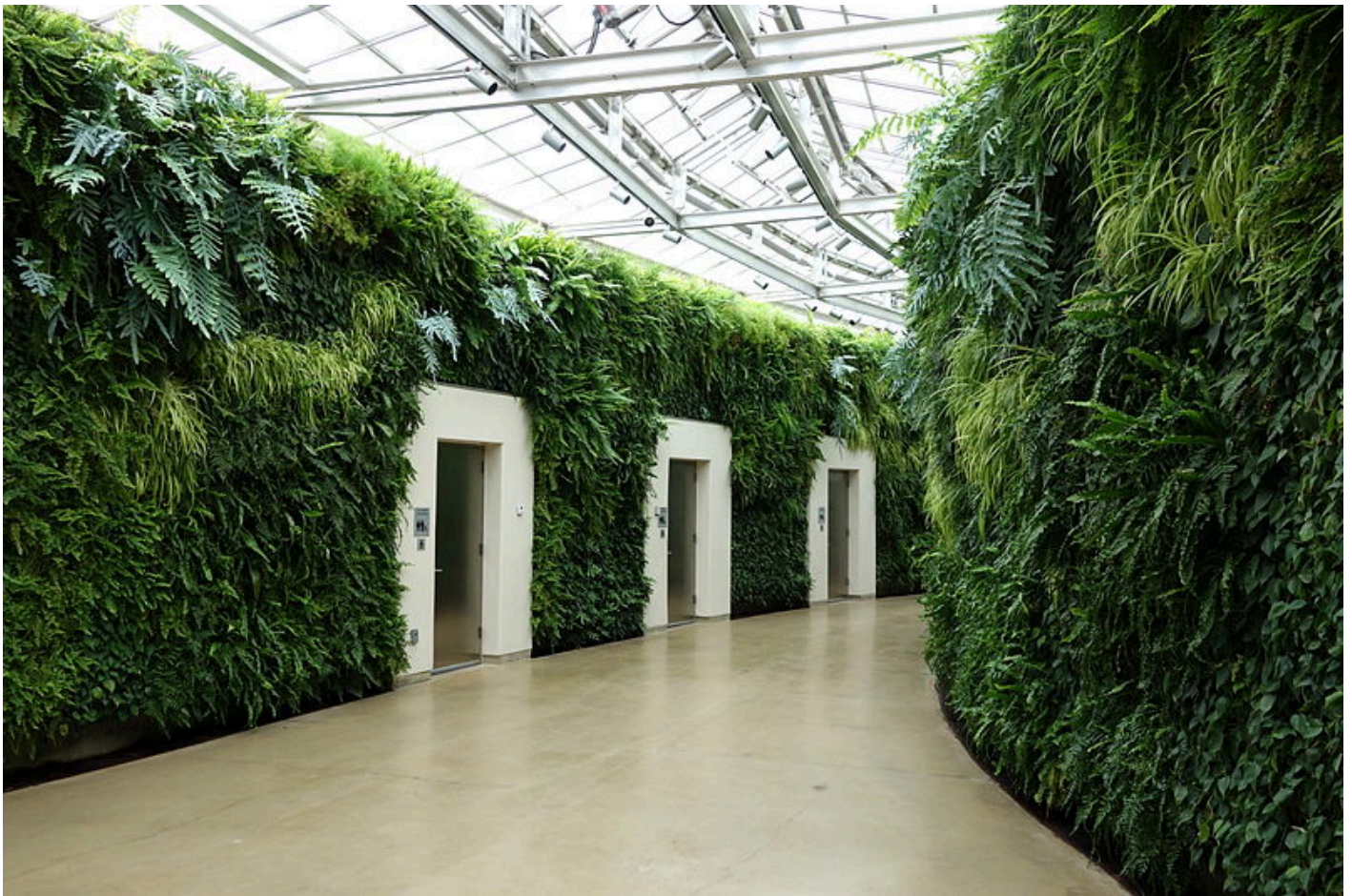
Figure 1.2 Interior vertical gardens vegetated with tropical plants

The benefits of indoor plants have become part of the design of living and working environments in the 21 st century. Interior landscapes or plantscapes have diversified the use of tropical foliage and flowering plants in atria and large conservatories, indoor and vertical gardens, potted office plants and hanging baskets, as well as color bowls, dish gardens, and terrariums. Figure 1.2 shows an example of interior landscaping using vertical gardens vegetated with tropical plants.