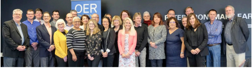
Group photo of participants attending the OERu meeting in Toronto, 12 & 13 October 2017 hosted by eCampusOntario.