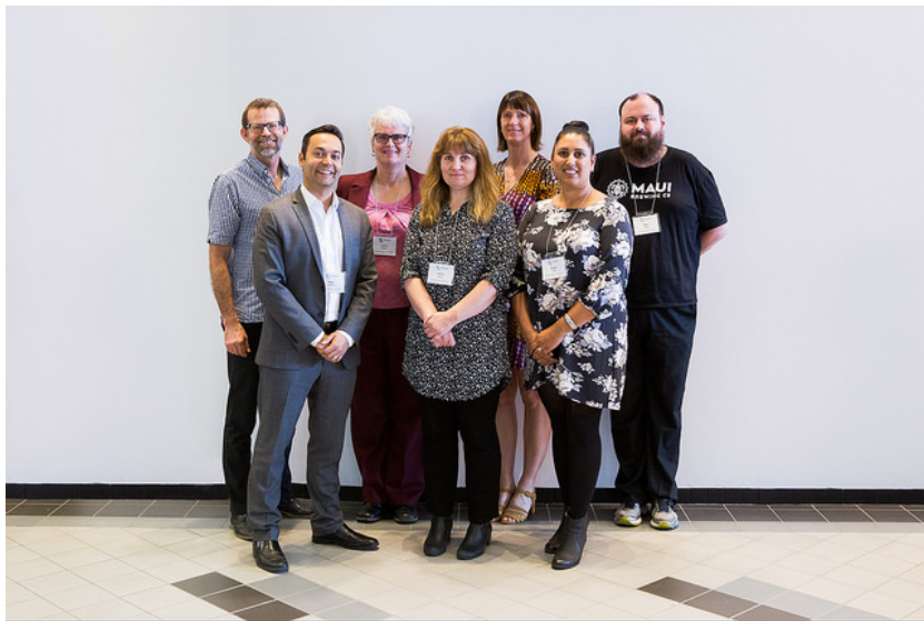
KPU OER grant recipients together with members of the Open Education Working Group, at the 2017 Open Textbook Summit.

KPU's leadership in open education is a product of both strong grassroots support across the institution and strong support from senior leadership. Internally, we owe much of our success to the diligent and thoughtful efforts of members of KPU's Open Education Working Group while externally, our close and ongoing partnership with BCcampus Open Education has been critical to our progress. Over the past three years, KPU's open education initiatives have grown in both scope and impact thanks in part to dedicated support in the forms of a 1-year appointment of a University Teaching Fellow in Open Studies (via a 50% course release) in 2017, a Special Advisor to the Provost on Open Education in 2018, and, most recently, the establishment of the new position of Associate Vice Provost, Open Education in 2019.