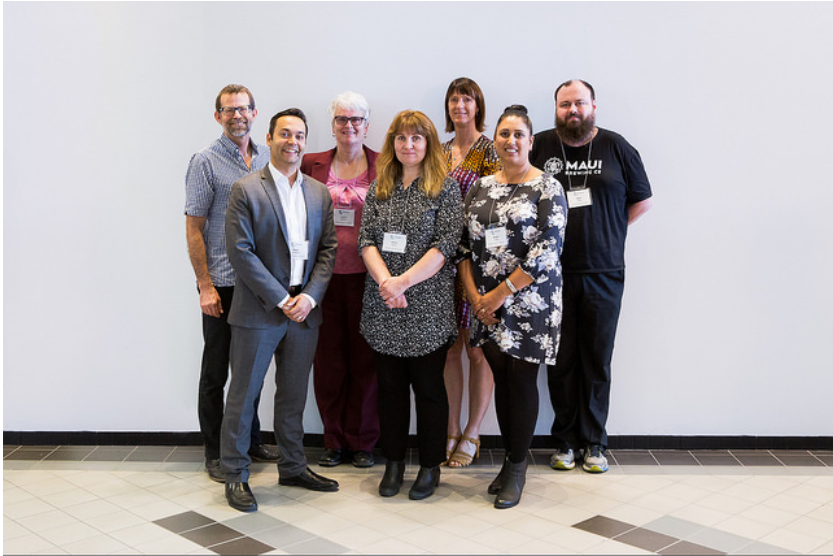
KPU OER grant recipients together with members of the Open Education Working Group, at the 2017 Open Textbook Summit.

KPU's leadership in open education is a product of both strong grassroots support across the institution and strong support from senior leadership. Internally, we owe much of our success to the diligent and thoughtful efforts of members of KPU's Open Education Working Group while externally, our close and ongoing partnership with BCcampus Open Education has been critical to our progress. Over the past three years, KPU's open education initiatives have grown in both scope and impact thanks in part to dedicated support in the forms of a 1-year appointment of a University Teaching Fellow in Open Studies (via a 50% course release) in 2017, a Special Advisor to the Provost on Open Education in 2018, and, most recently, the establishment of the new position of Associate Vice Provost, Open Education in 2019.