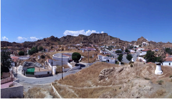
Guadix, Spain.

26. The geographic/topographic location of a settlement depends on the needs it must serve for itself (its inhabitants, natural setting, etc.) and the larger co-dependent settlement system to which it belongs.