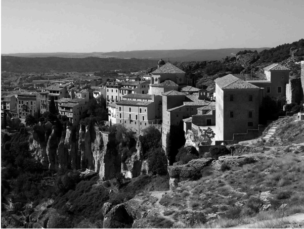
Cuenca, Spain.

Abu-Lughod, J. (May, 1987). The Islamic city: Historic myths, Islamic essence, and contemporary relevance. International Journal of Middle East Studies . Vol. 19(2), 155-176.