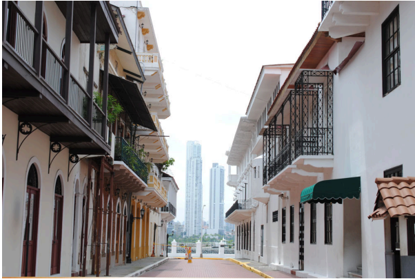
Panama City, Panama.