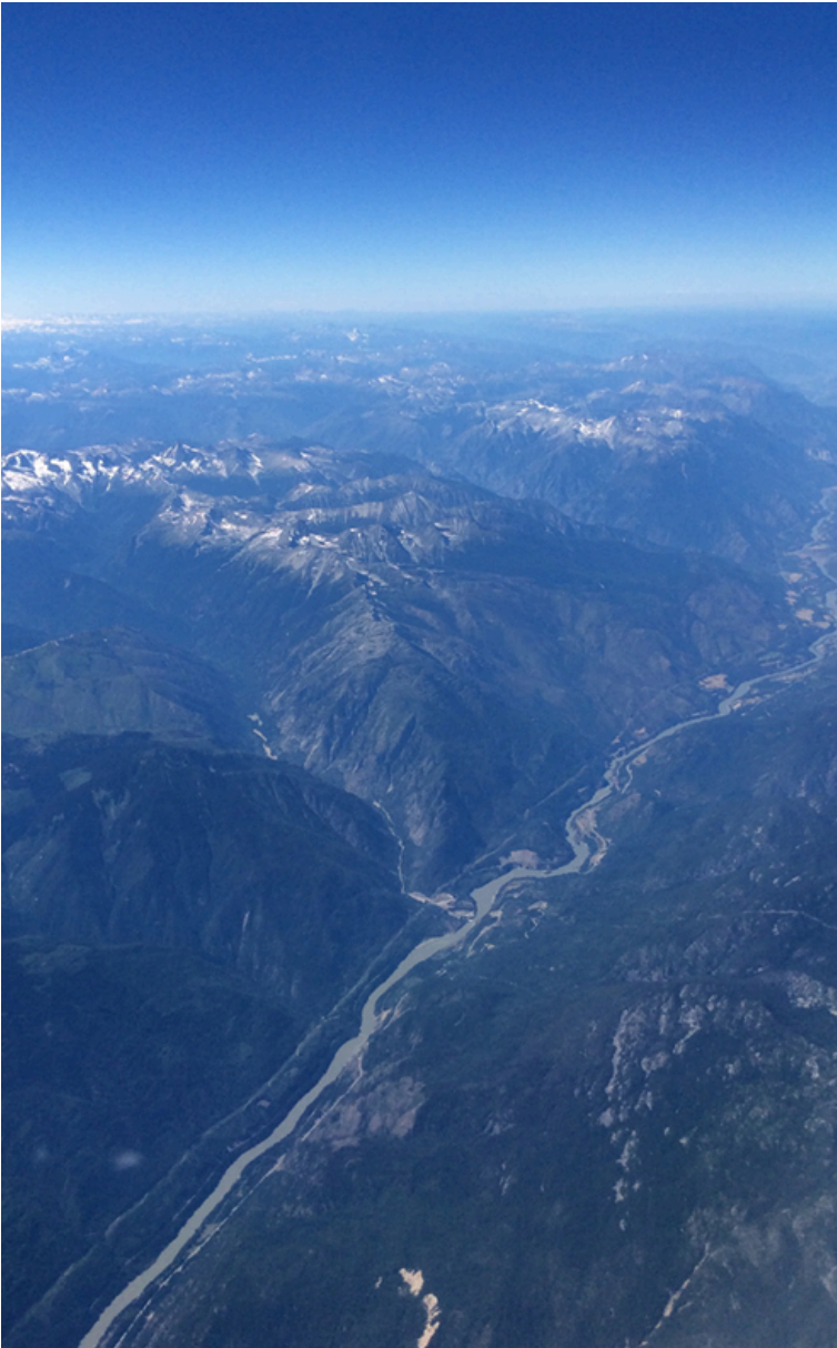
British Columbia, Canada