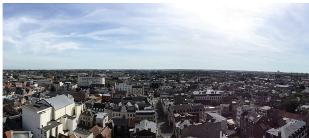
Arras, France.