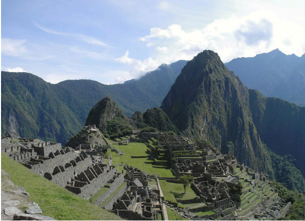
Machu Picchu, Peru.

30. The functions of a settlement depend on the geographic and topographic location, geologic conditions, technological development, population size, and the role within the larger settlement system.