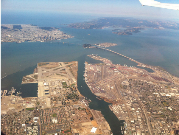
San Francisco, US.

40. The main force which shapes human settlements physically is centripetal—that is, the inward tendency towards a close interrelationship of all its parts.