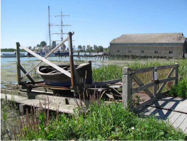
Richmond, BC, Canada.

7. The development and renewal of settlements is a continuous process. If it stops, conditions for its death are created, but how long it will take depends on many factors.