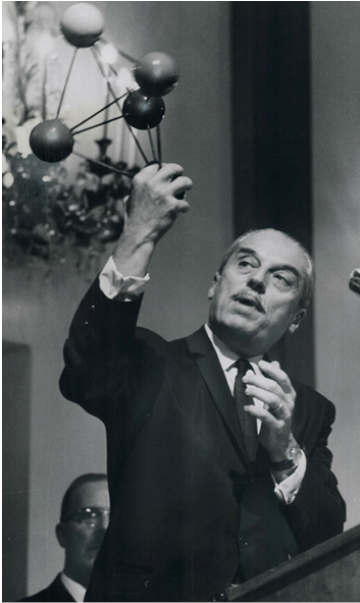
Constantinos Apostolou Doxiadis, 1967.

Needless to say, this was an extraordinary time.....and among these icons one must place Greek architect and planner, Constantinos Apostolou Doxiadis. Best known for his planning of Islamabad, Pakistan, his life was sadly cut short in 1975 by Lou Gehrig's disease at the age of 61. At the height of his popularity, his face blessed the cover of Time Magazine, with work spanning 40 countries. A prolific writer, the last decade of his life saw Doxiadis author no less than 7 comprehensive books, as well as various journal articles, that shared his research findings on settlements: research based on cutting edge computer