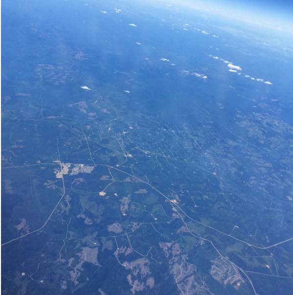
Northern Alberta, Canada.