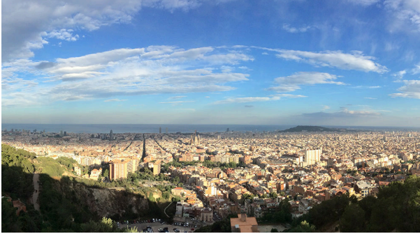
Barcelona, Spain.