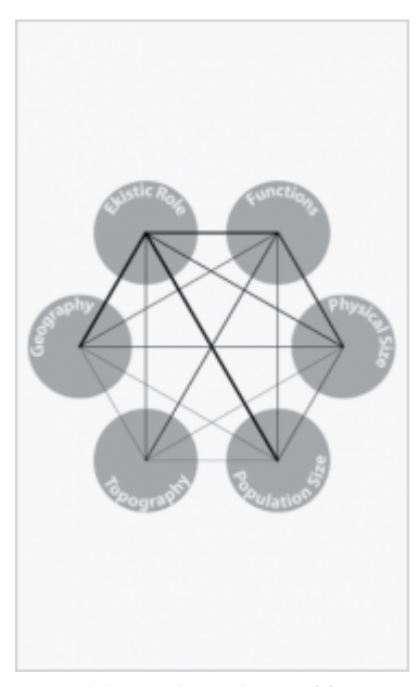
Doxiadis' interdependence of factors and functions. Graphic recreated by Author.

32. The functions and role of a settlement are interdependent with geography, topographic conditions, geological circumstance, as well as population and physical size.